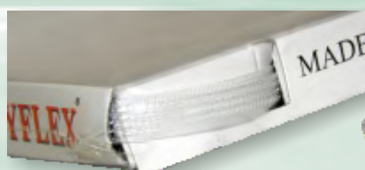
Detail of package